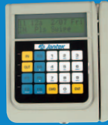
JTA350 Card Reader (Barcode, Magstripe, Proximity)