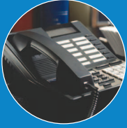
Telephone Punch (Up to 16 Lines)

the total solution for your time & attendance needs