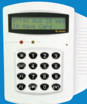
JTA250PC (Proximity, Magstripe)