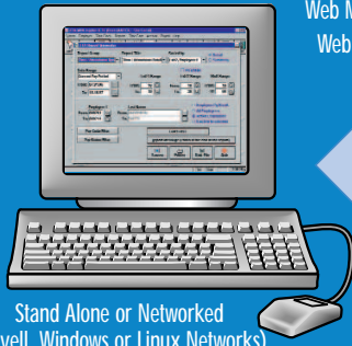
Stand Alone or Networked (Novell, Windows or Linux Networks)